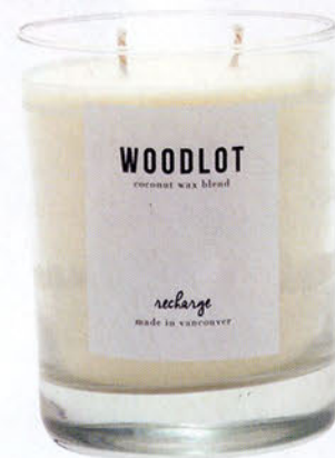
Woodlot candle | £25 Made from a petroleum-free coconut wax blend so it burns cleanly. workshopliving.co.uk