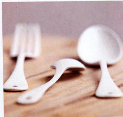
Cutlery by Cachette | from £6.50 Metal with a tactile white enamel coating, this is cutlery to impress. shop.thesimplethings.com