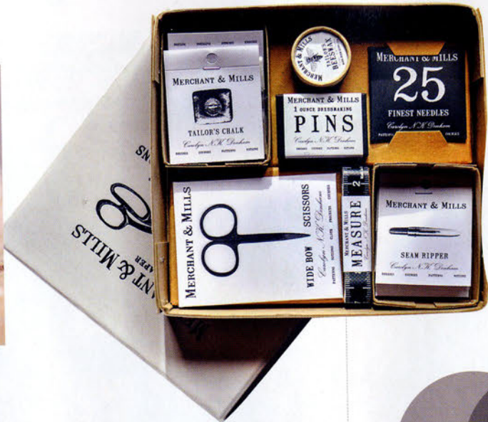
Notions box set | £42 Everything you need for any sewing project in one embossed cardboard box. Handy. merchantandmills.com