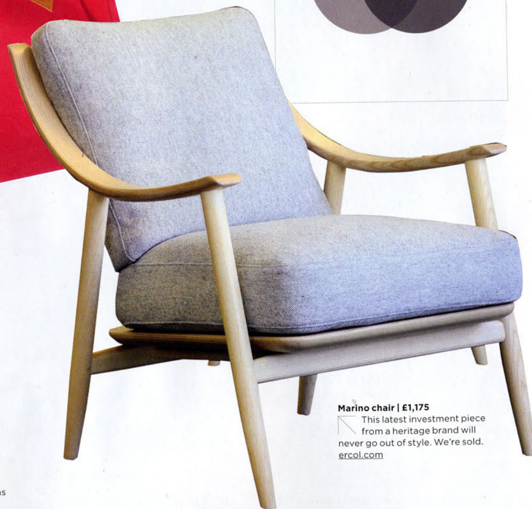
Marino chair | £1,175 This latest investment piece from a heritage brand will never go out of style. We're sold. ercol.com